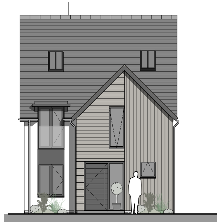
INDICATIVE FRONT ELEVATION