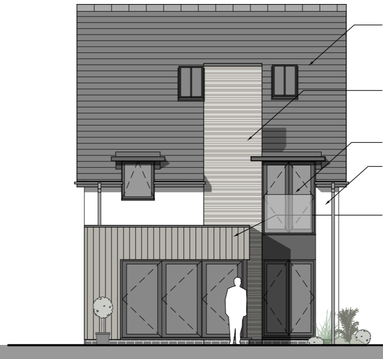
INDICATIVE REAR ELEVATION